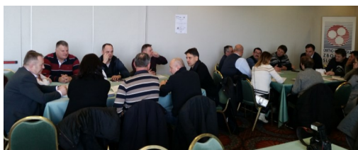
25/01/2019 - Portorož (SI)

Concerning the WBL Developer some competences were pointed up as Leadership qualities, Critical thinking , Analytical skills , Excellent communication skills , Negotiating skills , Teamwork and Adaptation to changing circumstances . It is possible to sum up the importance of the transversal skills .