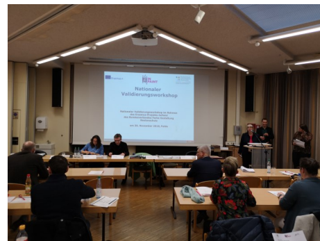
30/11/2018 - Fulda (DE)

Concerning the WBL Developer some competences were pointed up as Leadership qualities, Critical thinking , Analytical skills , Excellent communication skills , Negotiating skills , Teamwork and Adaptation to changing circumstances . It is possible to sum up the importance of the transversal skills .