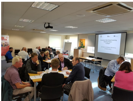
19/11/2018 - Coventry (UK)